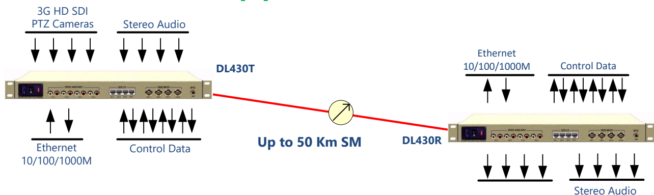
Typical DL430T & DL430R Application